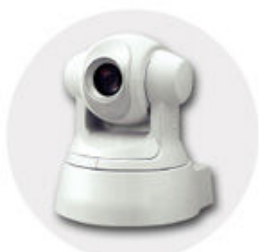
PTZ control (IP & Analog)