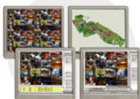
Support CMS (CM3000)