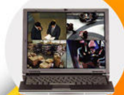
WebViewer with audio & video