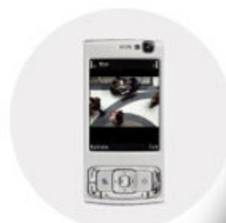
Mobile phone viewer (JavaViewer)