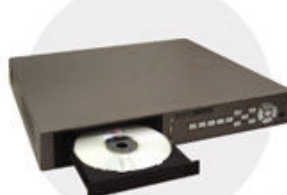
Backup to DVD±RW (Up to 4.2GB)