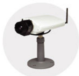
Support IP cameras

AVerDiGi EB1704HB DVD is a DVR market leader when it comes to supporting both IP and Analog cameras / PTZ. Functions such as DVD±RW backup and JavaViewer on mobile phone further make it a hot selling product for surveillance requirements.