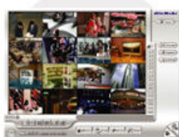
Support Remote Console